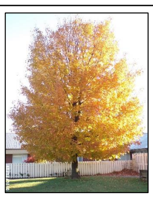
Autumn has officially arrived!!!